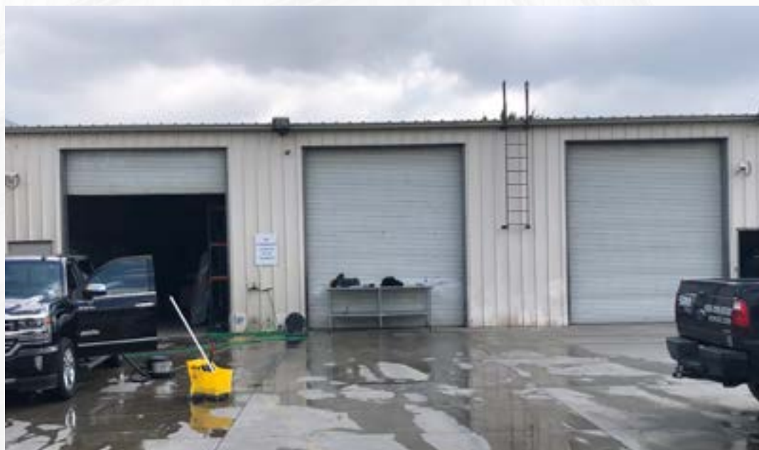
WAREHOUSE LOCATED JUST NORTH OF DOWNTOWN VISALIA