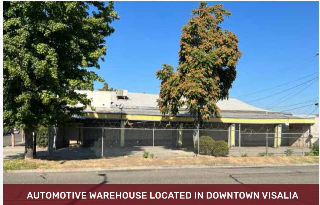
AUTOMOTIVE WAREHOUSE LOCATED IN DOWNTOWN VISALIA