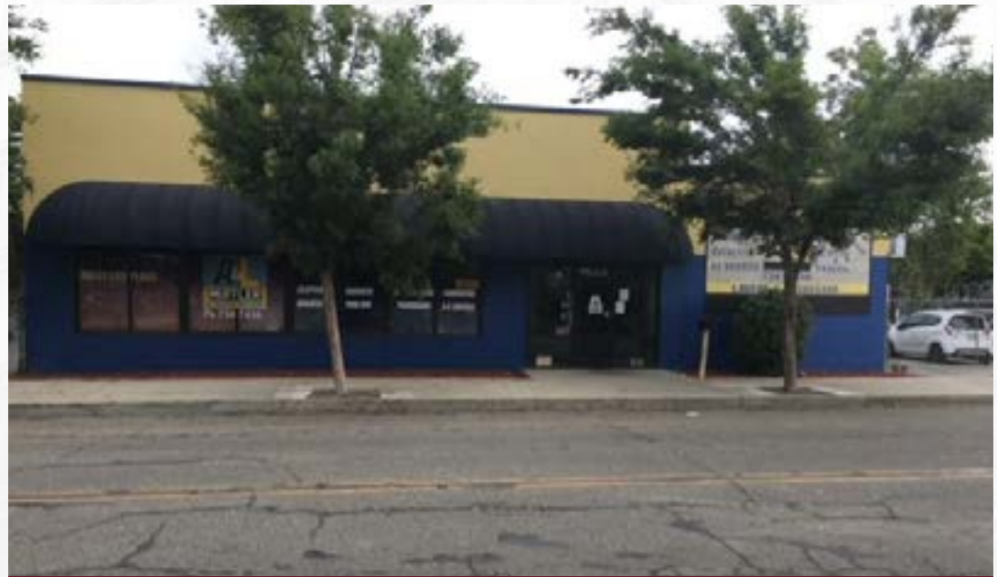
AUTOMOTIVE WAREHOUSE LOCATED IN DOWNTOWN VISALIA