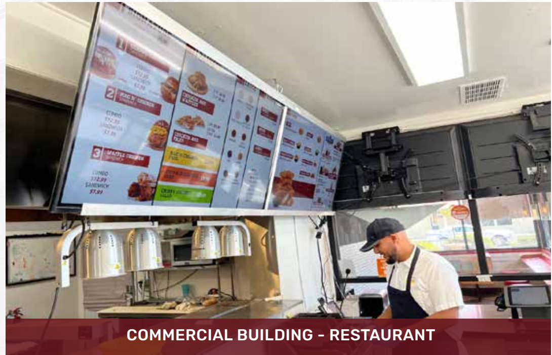
COMMERCIAL BUILDING - RESTAURANT