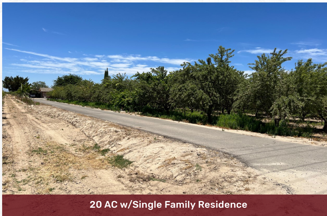
20 AC w/Single Family Residence