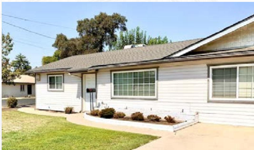
OFFICE BUILDING LOCATED ON MINERAL KING