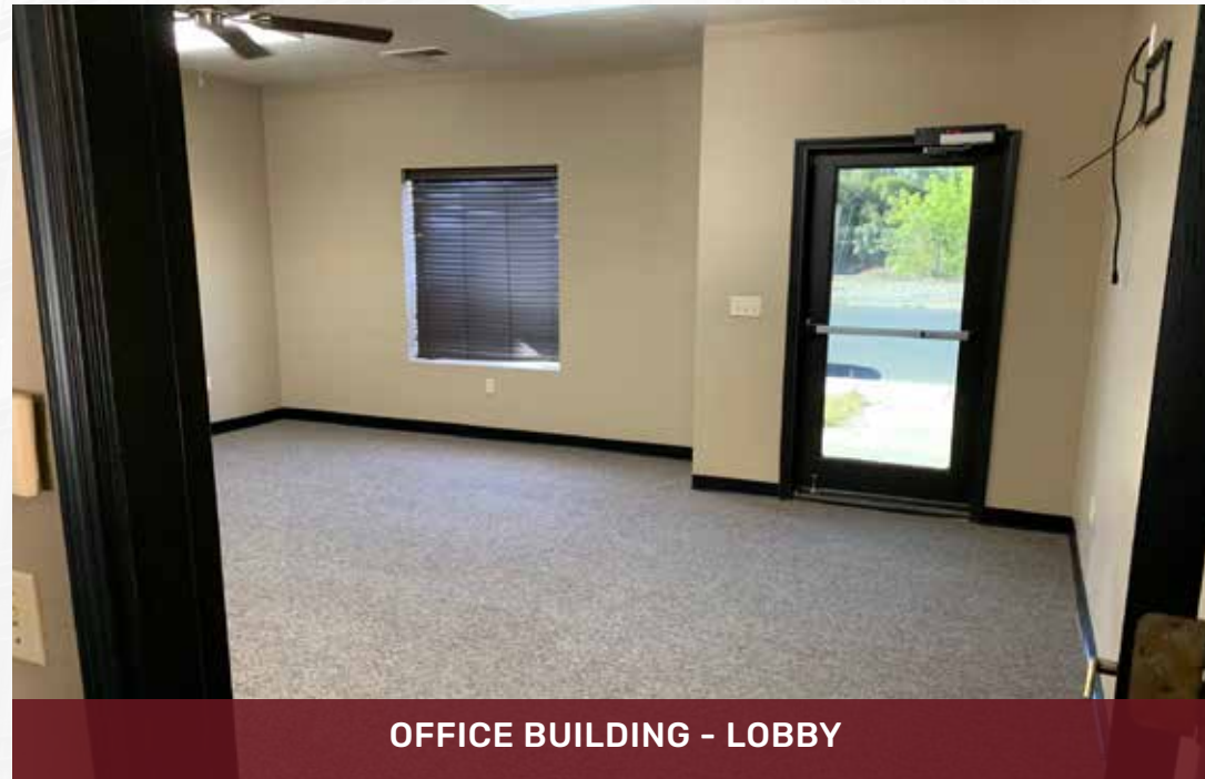
OFFICE BUILDING - LOBBY