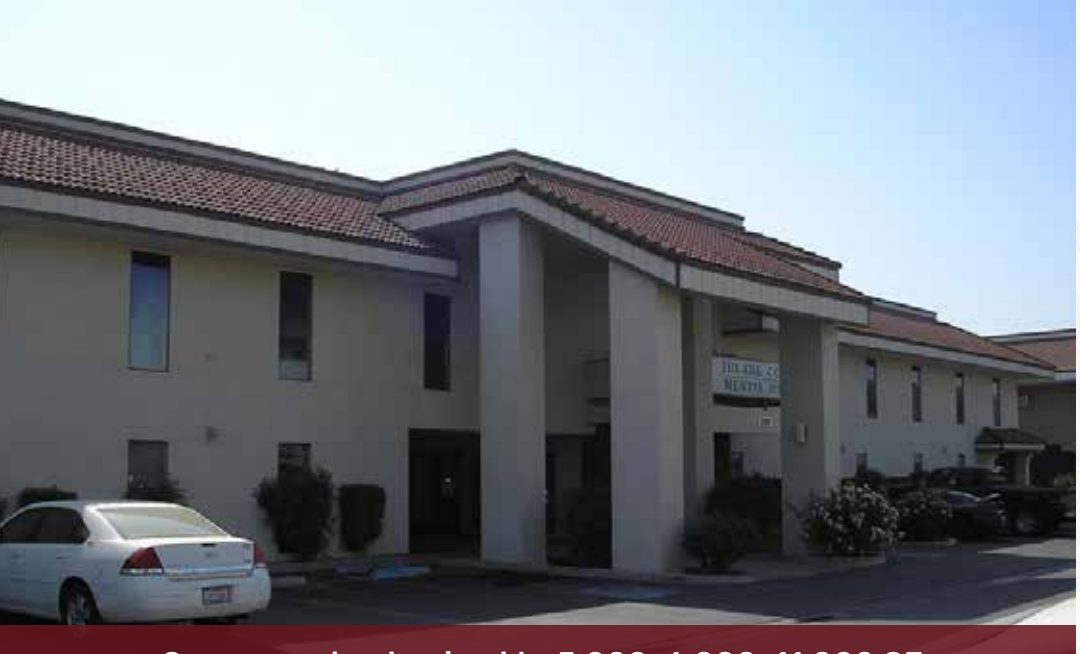
Space can be demised to 5,000, 6,000, 11,000 SF